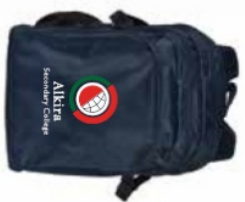
8303200 College Backpack