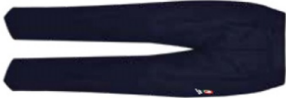
1114060 Flexivaist Formal Pants