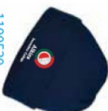
1100520 Acrylic Beanie