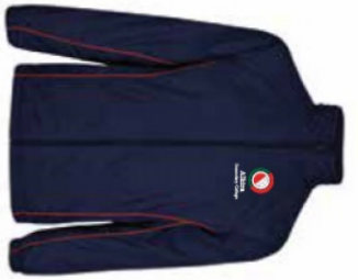
1111412 Spray Jacket with Contrast Piping

PROPERTY OF PSW. Copyright 2021 ALKIRA SECONDARY COLLEGE STORYBOARD 20/05/21