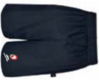
1100850 Mesh Sports Shorts