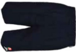
1113060 Gaberdine Shorts