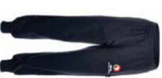
1110737 Trackpants Zip Cuff