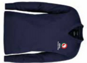
1105050 Wool Blend Jumper