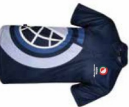
1111869 S/S Sublimated Sports Polo