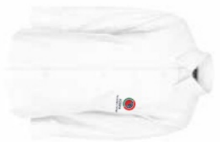
1101055 L/S Shirt