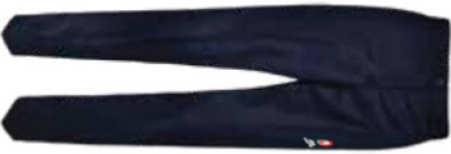
1111991 Tailored Pants