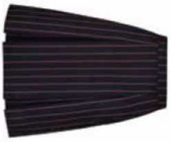
1104100 Box Pleat Skirt