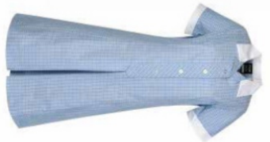
1100573 Summer Dress with Contrast Collar & Cuffs