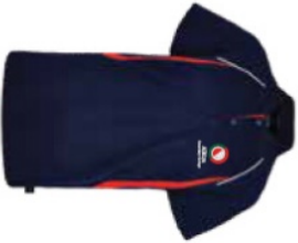
1118563 S/S Polo Shirt