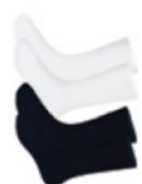
2511050 Crew Socks White & Black