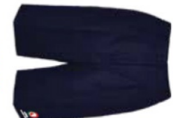
1111927 Tailored Shorts