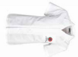
1101010 S/S Hip Shirt