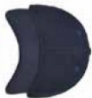
1101919 Baseball Cap