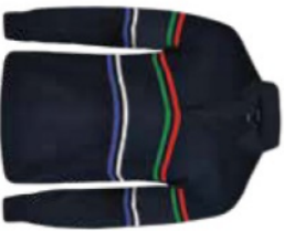
1111887 Rugby Jumper